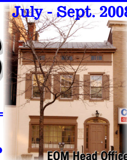
EOM Head Office