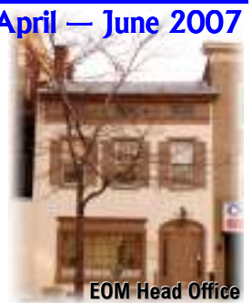
EOM Head Office