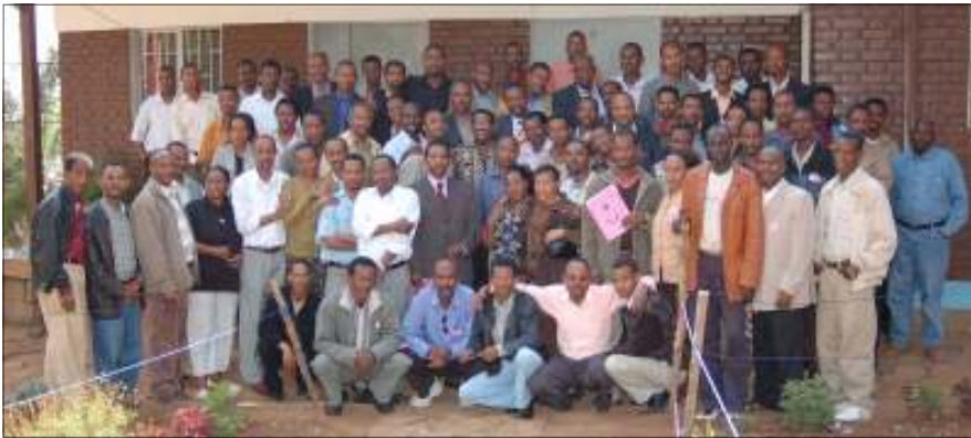
Participants of the Leadership Training in Addis Ababa, the week of January 22, 2007

duct two leadership seminars for 400 church leaders. Pastors, evangelists and qualified lay leaders who came from up to ten churches from various regions of the country participated in the three-day leadership seminar. The congregations of all the churches in the area also attended a two-day evangelistic meeting. In those meetings God gave us His power to challenge non-believers to give their lives to God. As a result we saw about 35 people make first-time commitments to follow Christ, and many Ethiopian believers were spiritually renewed and encouraged. We are astounded by the feedback that we have received from those who attended the seminars. God is saving and changing lives, and continues to use us to impact tens of thousands of Ethiopians. Praise the Lord! Please continue to pray and support us in our efforts to reach out to God's people for His Kingdom. May God richly bless you!